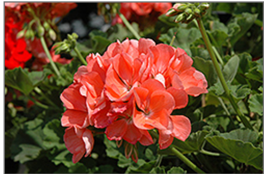
Allure Salmon Geranium flowers