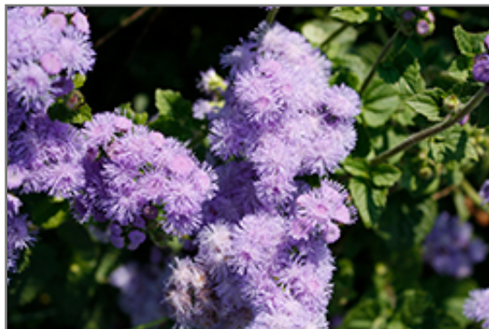
Blue Horizon Flossflower flowers

Blue Horizon Flossflower is recommended for the following landscape applications;