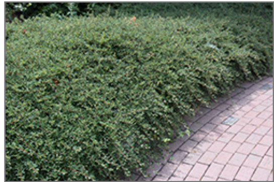
Coral Beauty Cotoneaster