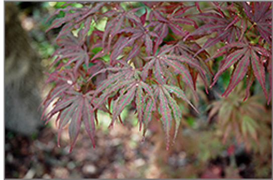
Mikazuki Japanese Maple foliage