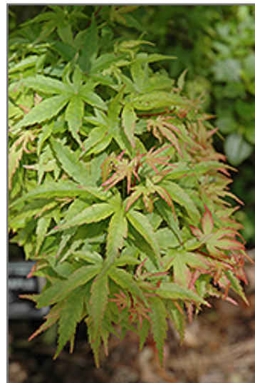
Sharp's Pygmy Japanese Maple foliage