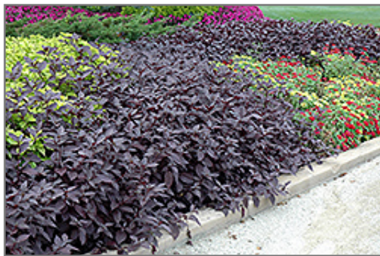
Purple Knight Alternanthera