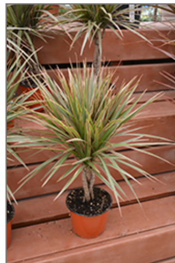
Colorama Dracaena in full

When grown indoors, Colorama Dracaena can be expected to grow to be about 3 feet tall at maturity, with a spread of 24 inches. It grows at a medium rate, and under ideal conditions can be expected to live for approximately 10 years. This houseplant performs well in both bright or indirect sunlight and strong artificial light, and can therefore be situated in almost any well-lit room or location. It does best in average to evenly moist soil, but will not tolerate standing water. The surface of the soil shouldn't be allowed to dry out completely, and so you should expect to water this plant once and possibly even twice each week. Be aware that your particular watering schedule may vary depending on its location in the room, the pot size, plant size and other conditions; if in doubt, ask one of our experts in the store for advice. It is not particular as to soil type or pH; an average potting soil should work just fine.