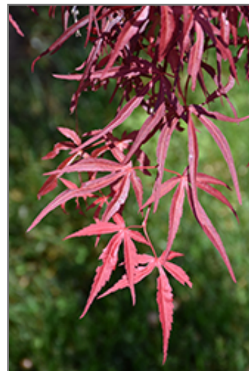
Red Spider Japanese Maple foliage