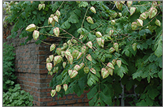
Golden Rain Tree fruit

This tree should only be grown in full sunlight. It is very adaptable to both dry and moist locations, and should do just fine under average home landscape conditions. It is considered to be drought-tolerant, and thus makes an ideal choice for xeriscaping or the moisture-conserving landscape. It is not particular as to soil type or pH, and is able to handle environmental salt. It is highly tolerant of urban pollution and will even thrive in inner city environments. This species is not originally from North America, and parts of it are known to be toxic to humans and animals, so care should be exercised in planting it around children and pets.