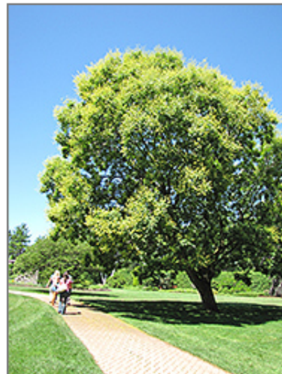
Golden Rain Tree in bloom

Golden Rain Tree is recommended for the following landscape applications;