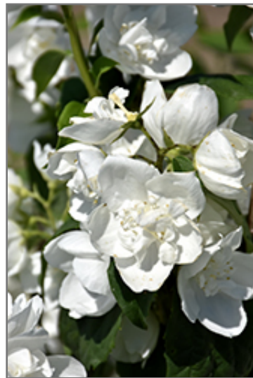
Snow White Mockorange flowers

Snow White Mockorange will grow to be about 6 feet tall at maturity, with a spread of 5 feet. It tends to fill out right to the ground and therefore doesn't necessarily require facer plants in front, and is suitable for planting under power lines. It grows at a fast rate, and under ideal conditions can be expected to live for approximately 30 years.