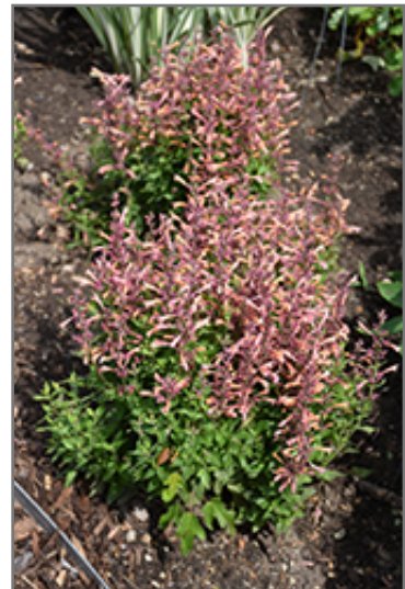
Mango Tango Hyssop in bloom