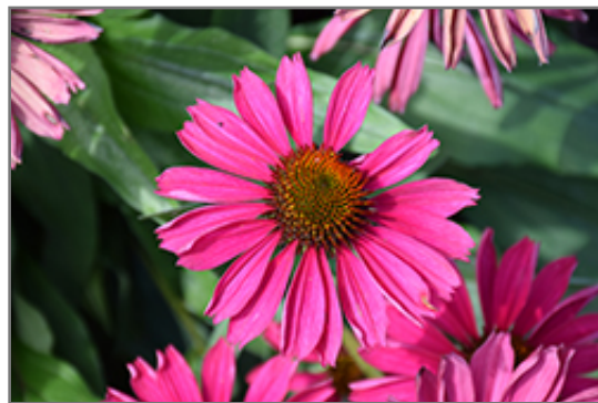
Kismet Raspberry Coneflower flowers