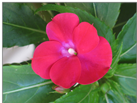
Infinity Cherry Red New Guinea Impatiens flowers