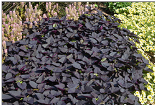
Sweet Caroline Sweetheart Jet Black Sweet Potato Vine

Sweet Caroline Sweetheart Jet Black Sweet Potato Vine is recommended for the following landscape applications;