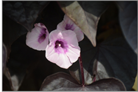
Sweet Caroline Sweetheart Jet Black Sweet Potato Vine flowers

Sweet Caroline Sweetheart Jet Black Sweet Potato Vine is a fine choice for the garden, but it is also a good selection for planting in outdoor containers and hanging baskets. Because of its trailing habit of growth, it is ideally suited for use as a 'spiller' in the 'spiller-thriller-filler' container combination; plant it near the edges where it can spill gracefully over the pot. Note that when growing plants in outdoor containers and baskets, they may require more frequent waterings than they would in the yard or garden.