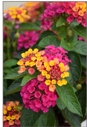
Luscious Royale Cosmo Lantana flowers

Luscious Royale Cosmo Lantana is recommended for the following landscape applications;