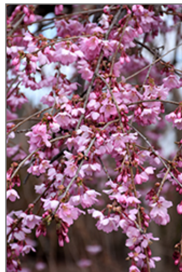
Pink Cascade Weeping Cherry flowers