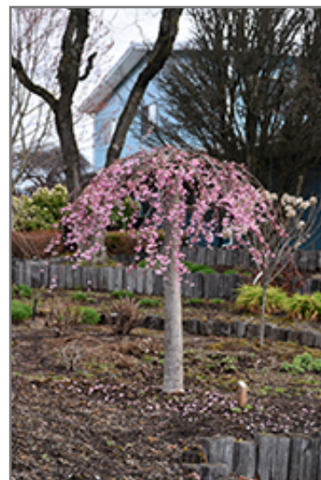
Pink Cascade Weeping Cherry in bloom