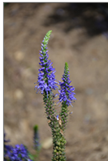
Magic Show Wizard of Ahhs Speedwell flowers