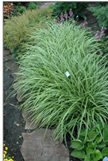
Ice Dance Sedge