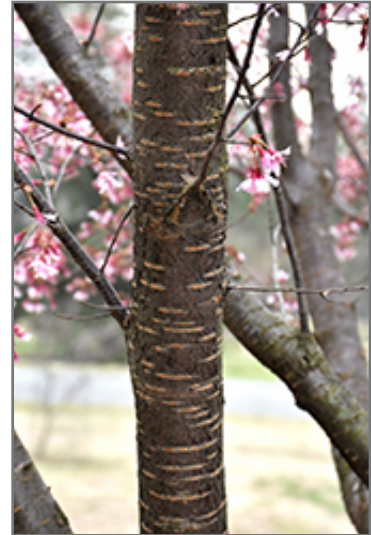
Autumnalis Higan Cherry bark

* This is a 'special order' plant - contact store for details