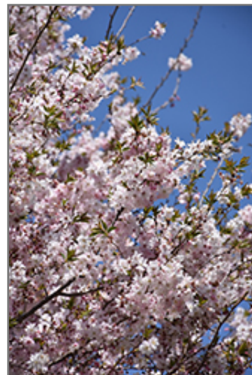
Autumnalis Higan Cherry flowers