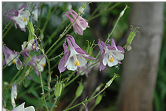
Common Columbine flowers