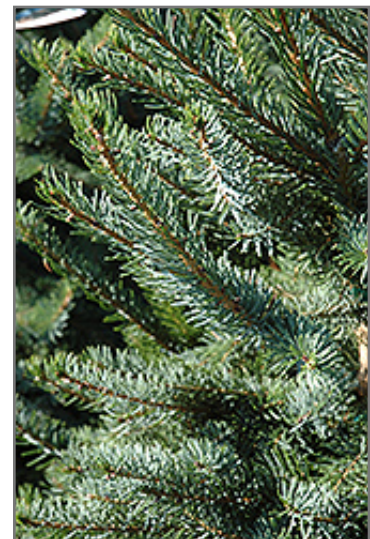
Bruns Spruce foliage