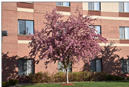
Robinson Flowering Crab in bloom

Robinson Flowering Crab is recommended for the following landscape applications;