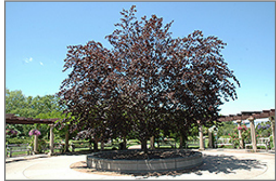
Purple Beech