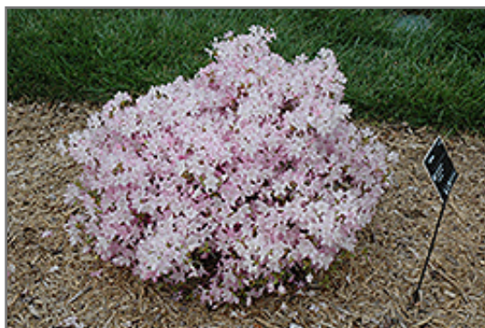
Bubblegum Rhododendron in bloom