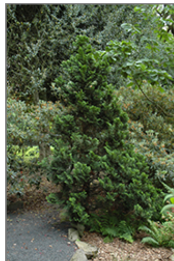
Nana Dwarf Hinoki Falsecypress

Nana Dwarf Hinoki Falsecypress is recommended for the following landscape applications;