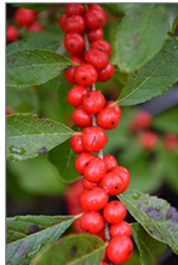
Red Sprite Winterberry fruit

Red Sprite Winterberry is recommended for the following landscape applications;