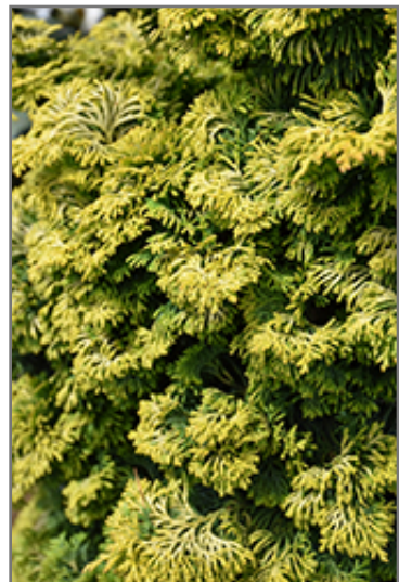
Dwarf Golden Hinoki Falsecypress foliage