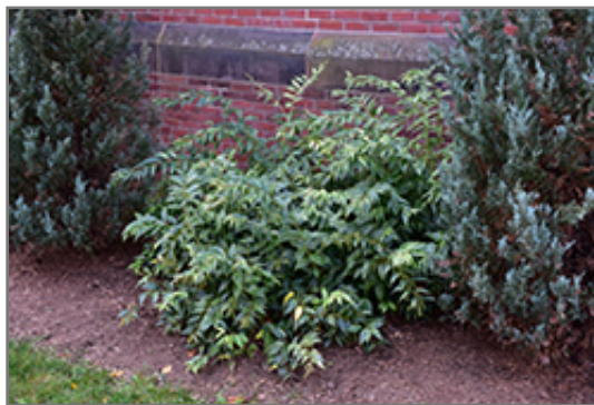
Rainbow Fetterbush