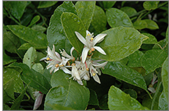
Improved Meyer Lemon flowers

Aside from its primary use as an edible, Improved Meyer Lemon is suitable for the following landscape applications;